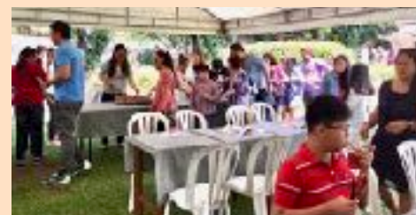
April 29, sponsored by Libis BEC