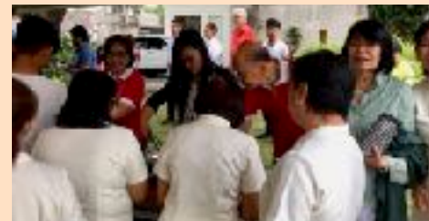
April 8, sponsored by Diwanihan Kristiyano