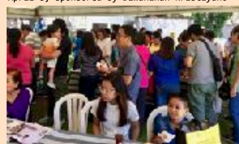
April 15, sponsored by Catechetical Ministry