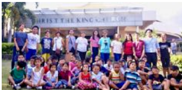
Younger set, above, and older kids, below