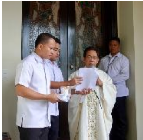
congregation inside. After brief prayers, he turned around to bless the people inside the chapel.