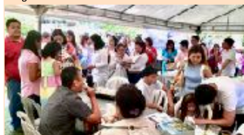
April 1, Easter Sunday, sponsored by Acropolis