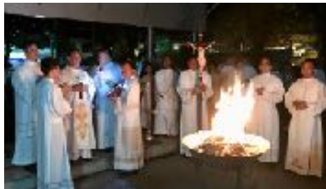
The Service of the Light, above and below, kicks off the Solemn Easter Vigil