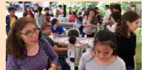
May 6, sponsored by Mustard Seed Ministry