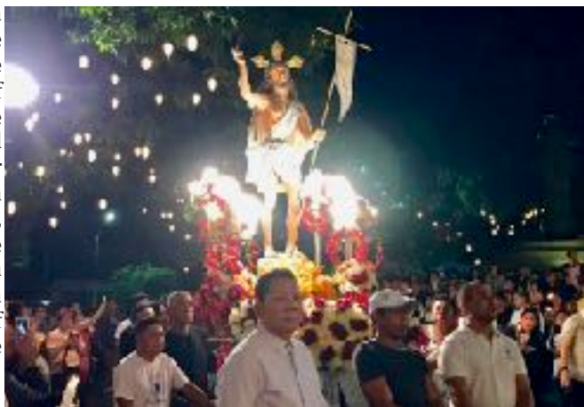
Above, the Risen Christ about to leave the Acropolis gate escorted by male parishioners. Below, the 'Salubong' between the Risen Christ and the Blessed Mother, still in veil. Bottom, a girl 'angel' lifts the veil from the Blessed Mother's face.

The Solemn Easter Vigil last March 31 started at 8 pm with the Service of the Light, just outside the main church. This included the Blessing of the Fire and the preparation and lighting of the Paschal Candle. The congregation then trooped in, as Fr. Bong and the other CTK priests went through the Liturgy of the Word, which consisted of multiple readings, even as the church remained in darkness, then followed by the Liturgy of Baptism, and finally, the Liturgy of the Eucharist.