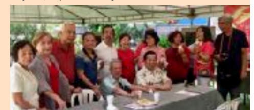
May 20, sponsored by the Life in the Spirit Prayer Community