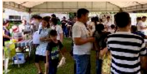
March 18, sponsored by Apostleship of Prayer