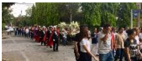
The procession of the Santo Entierro and Madre Dolorosa through Greenmeadows 1