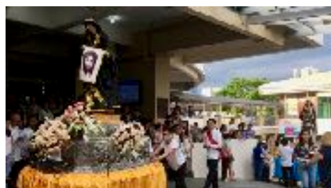
Above, the procession begins, with the image of St. Veronica at the foreground, followed by St. Marta. Bottom, the Santo Entierro image.