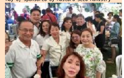
May 13, sponsored by Greenmeadows 1