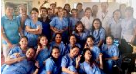
The livelihood class graduated last April 3.

The CTK Ladies of Charity's livelihood project scholars had their 'graduation' last April 3. The 26 graduates completed the Hilot Massage training and had their mass graduation ceremony at the Inner Lobby of Quezon City Hall.