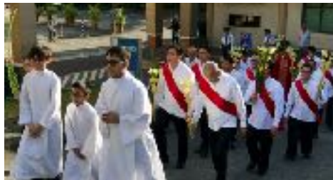
Procession going to the Main Church for the 7:30AM mass.

By Saturday April 8, palm vendors had already lined up Green Meadows Avenue