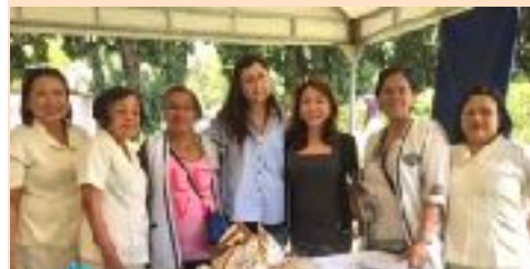
March 25, sponsored by Catholic Women's League