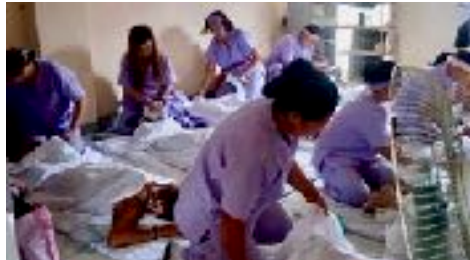
The next livelihood class at Krus na Ligas.