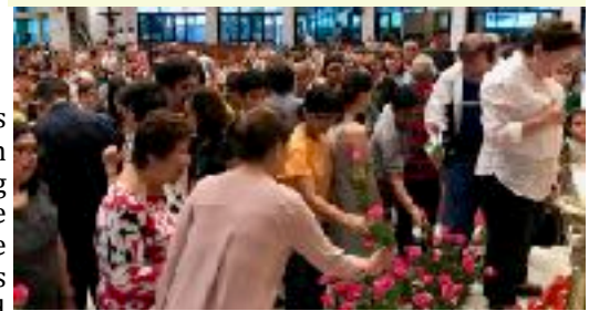
Flower offering of long stemmed red roses during the May 19 Flores de Mayo mass, above and below.

of long-stemmed red and white roses, and finally mass at 6 pm.