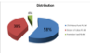
Remittance to Diocese of P3.4M