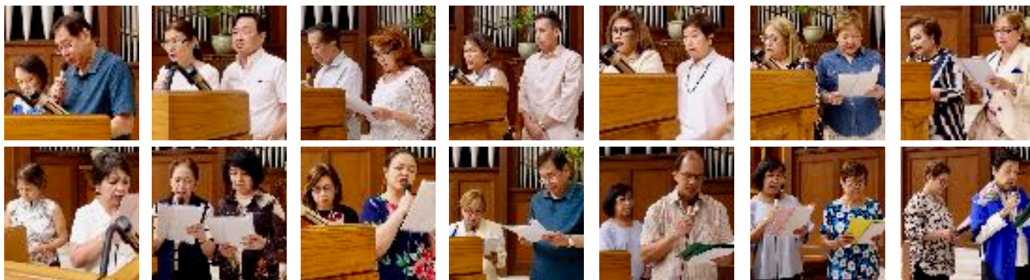
Pastoral Council members.

that station, but which always ended with 'Holy God, Holy Mighty One, Holy Immortal One, have mercy on us.' The priest then blesses the family members and thanks them for their service before moving on to the next station, even while the Way of the Cross song is sung in the background.