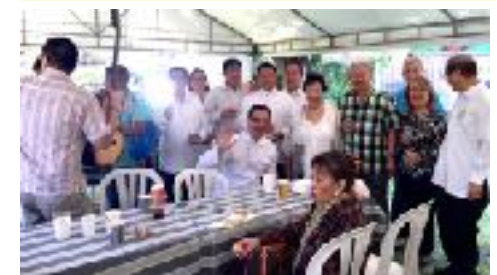
February 3, sponsored by Stewardship Committee