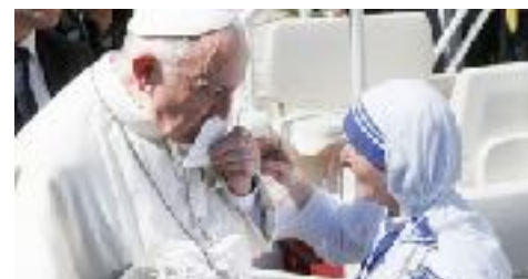
St. Teresa of Kolkata will always be 'Mother' Teresa, says Pope Francis

Pope Francis's message also praised the generosity of so many volunteers who, he said, are so important in health care and who eloquently embody the spirituality of the Good Samaritan. He thanked the many associations run by volunteers that are committed to particular fields of health care including those who promote the rights of the sick, raise awareness and encourage prevention. Noting that countless persons who are ill, alone, elderly or frail in mind or body benefit from these services, he urged them to continue to be a sign of the Church's presence in a secularized world: 'Volunteer work passes on values, behaviours and ways of living born of a deep desire to be generous. It is also a