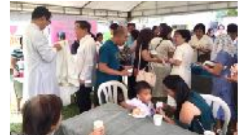
January 13, (two photos above) sponsored by Ladies of Charity and Apostleship of Prayer