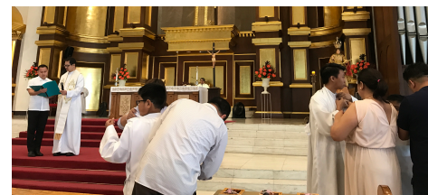
The three new Altar Servers helped by their parents to put on their albs, above

make sure that the EMHCs and LeComs who failed to attend the the last one held last November 18 had another chance to get accredited for 2019. The 42 LeComs joined the 95 LeComs commissioned on November 18 plus the 12 new lectors commissioned a week earlier, for a total of 149 authorized 2019 lectors and commentators.