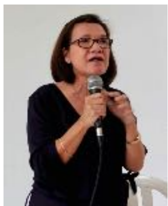
the Confraternity of Our Lady of Mediatrix of All Grace