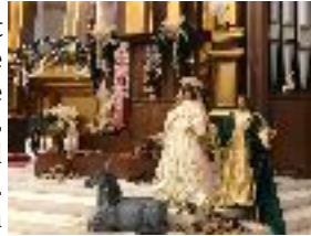
Below left, the belen tableau before Christ's birth; and below right, tableau after Christ's birth

Jesus, a no-longer-pregnant Mary, the same Joseph, the three kings, angels, and additional stable animals. The belen