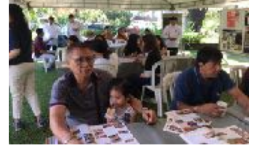
January 6, sponsored by the BEC