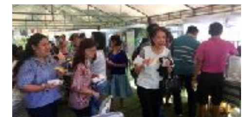
February 17, sponsored by Knights of Columbus