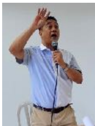
Lellis later that morning.