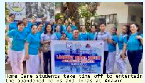
Home Care students take time off to entertain the abandoned lolos and lolas at Anawin

Program coursework includes: introduction to home health