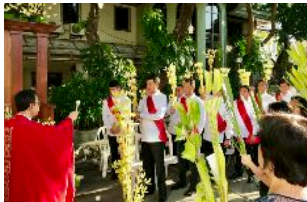
Above, below, and right, photos from last year’s Lenten Season and Easter Triduum events