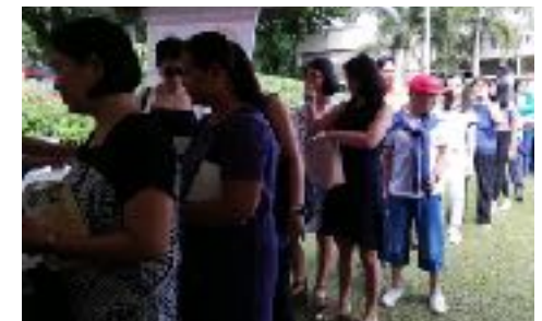
January 20, sponsored by Mustard Seed and Youth Ministries