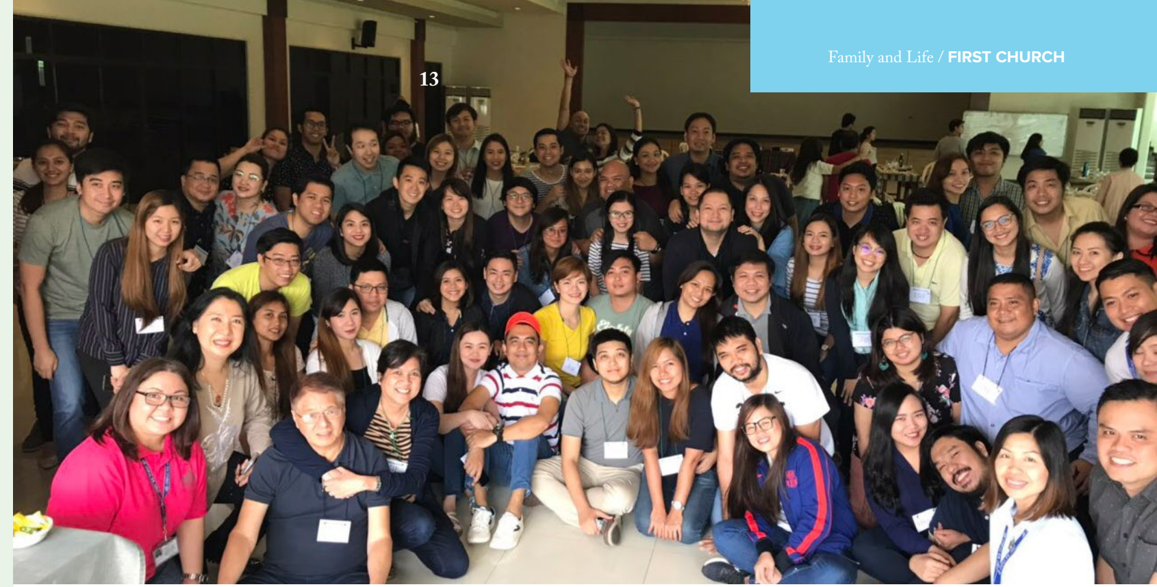
One of the MVP classes